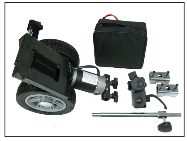
The Power Assist Unit