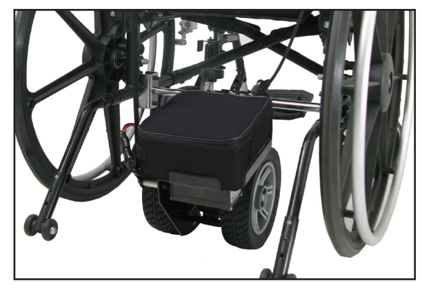
The Power Assist Battery Pack

The information contained herein is correct at the time of publication; due to the manufacturer's commitment to constant improvement and development, they reserve the right to alter specifications without prior notice.