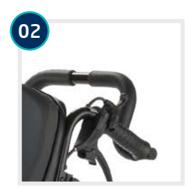
Article 1080609/ 1080611