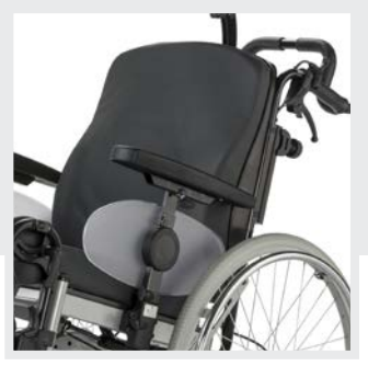
Adaptable in every respect