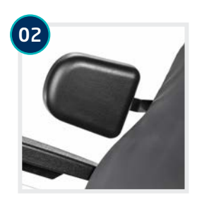
Article 1080610/ 1080612