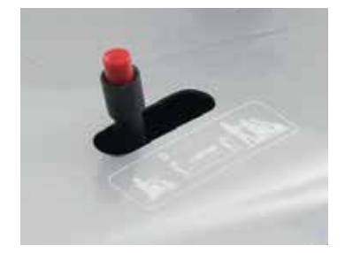
This unique two-step disengaging lever prevents the scooter from accidentally freewheeling.