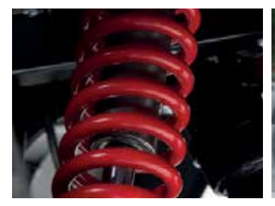
Advanced suspension for a smooth and comfortable drive over rugged terrain.