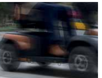
Easy drive direction stability keeps you in a straight line at high speeds for additional safety and stability.