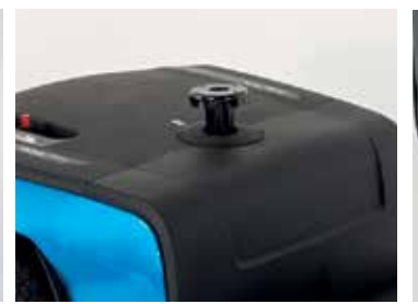
Reinforced seat column offers additional stability and safety when