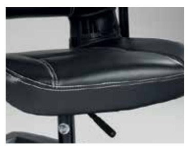
A soft padded seat provides additional comfort