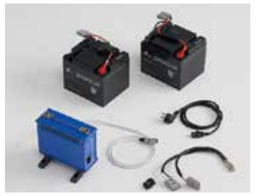
An optional off boardcharger allows you to conveniently charge the batteries away from the scooter.