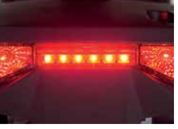
Clear, bright brake lighting warns people that the scooter is slowing down.