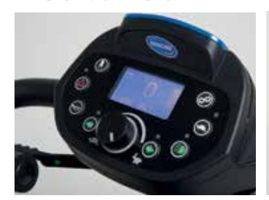
LCD dashboard for clear, easy to read information