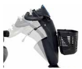
Users can easily adjust the tiller with a lever to suit their needs.