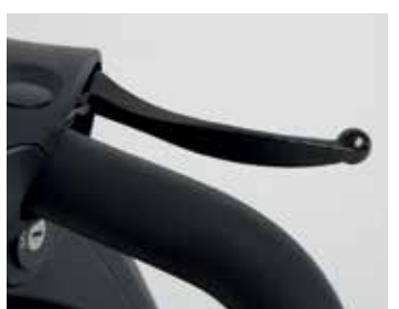
Ensures immediate braking if required.