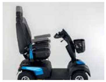
Seat riser electronically increase the seat height to achieve a preferred driving height.