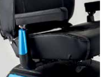
Reinforced height and width adjustable armrest.