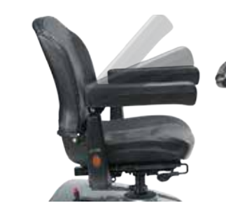
Swivel functionality and sliding rails ensure optimal seating position.