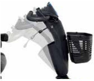
Users can easily adjust the tiller with a lever to suit their needs.