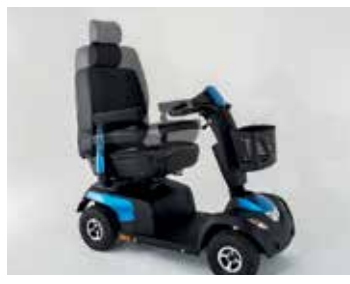
Improved suspension to offer superior comfort to larger individuals.