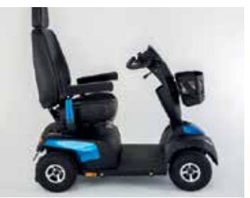
Seat suspension module offers additional comfort by adding an optional seat suspension.