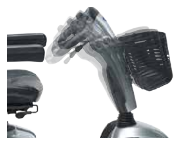
Users can easily adjust the tiller to suit their needs.