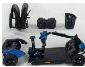
Effortless dismantling can be done in less than a minute for transportation.