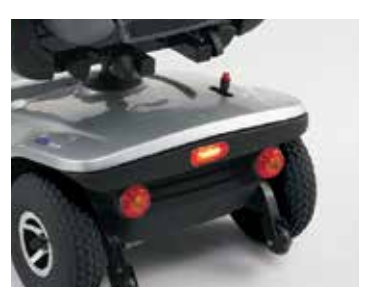
Rear brake lighting warns other people that the scooter is slowing down, thus preventing collisions.