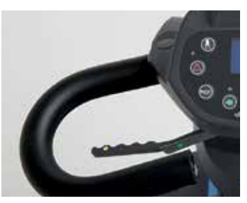
Ergonomically designed steering system makes for easier, more responsive control.