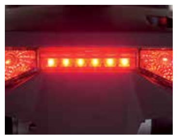
Clear, bright brake lighting warns people that the scooter is slowing down.